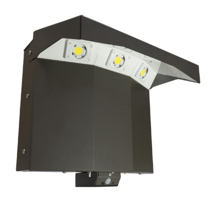
WP2UE With Battery Back-up

The ActiveLED® WP2 Series Wall Pack offers highly engineered optics and a sleek contemporary design ideal for security, pathway and perimeter lighting. With 150 Lumens per Watt and 5,861 Lumens, the 39 Watt,* WP2 Series Wall Pack provides nearly 1,000 sq. ft. of light coverage. The fixtures come with a full 10 year, No-Light-Loss Warranty - providing the building owner with over a decade of energy and maintenance savings. Applications include: Warehouse, Retail, Industrial, and Commercial Locations.